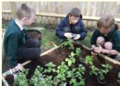
Planting the Union Jack floral display in May 2012 and the result one month later