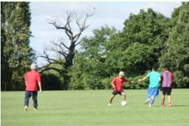
Wildridings Playing Field

Eight of Bracknell Town Council's recreational spaces are going to be protected for posterity after doing extremely well in the "Save a Space for Me" Queen Elizabeth II Fields Challenge public vote. Two of the fields are on the route – Wildridings Playing Field and Mill Park.