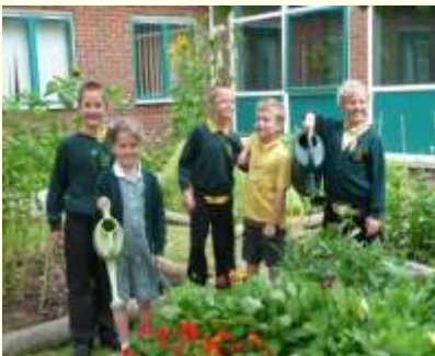
Some members from last year's winning Gardening Club