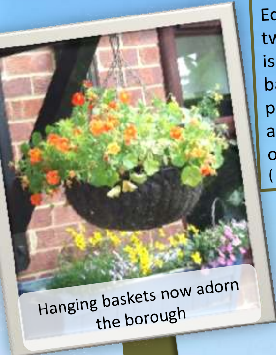
Hanging baskets now adorn the borough

The Bracknell in Bloom committee was keen to involve the whole community with this year's Bracknell in Bloom launch. They also wanted to incorporate the RHS Britain in Bloom Edible Britain launch theme. We held two public events showing how easy it is to plant and grow edible hanging baskets. Both events were extremely popular and many Bracknell gardeners are now incorporating innovative uses of edible plants in their front gardens. ( see appendix 2 for launch events posters)