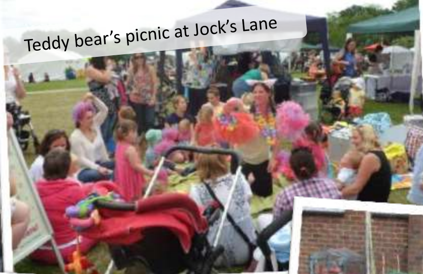
Teddy bear's picnic at Jock's Lane

C4 Community participation: year round involvement spring and summer