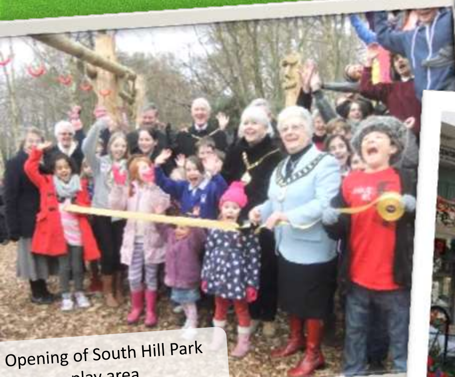
Opening of South Hill Park play area