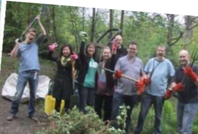
Maintenance work at Lily Hill Park with volunteers from Boehringer Ingelheim