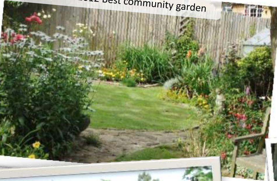
Your Gardens 2012 Best community garden

"Your Gardens", Bracknell's public horticultural competition, has been running since the early 1990s. The aim of the competition is to encourage the community to take part in Bracknell in Bloom and take pride in Bracknell, making it an attractive place to live, work and visit. Residents, businesses, schools and community groups can enter the competition which is judged in the summer. Entrants are invited to attend a Gala Evening held in the autumn when the prize winners are announced. "Your Gardens" prize winning entries always feature on the Thames and Chilterns in Bloom judges' tour.