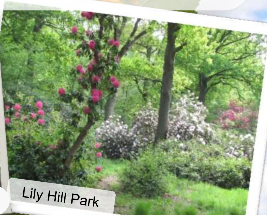
Lily Hill Park