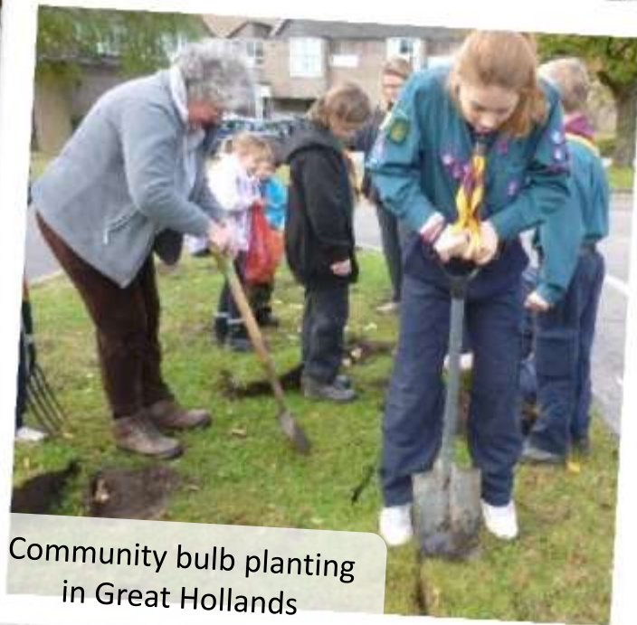
Community bulb planting in Great Hollands