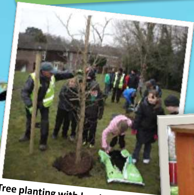
Tree planting with local schools, February 2013