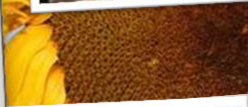
Arlington Square business park is a nice place to walk...