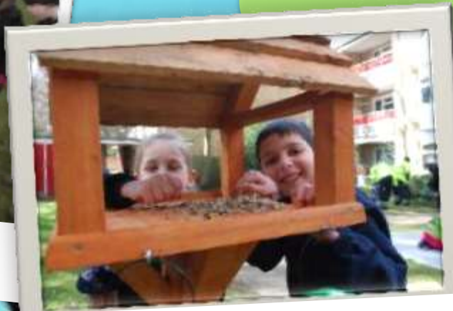
Creating bird tables and plantings at Harmans Water estate action day, March 2013