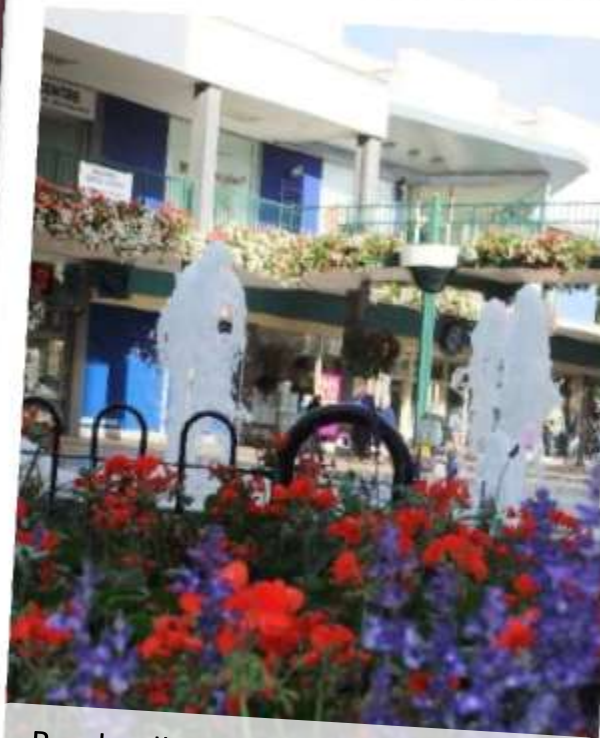
Bracknell town centre's well known water clock