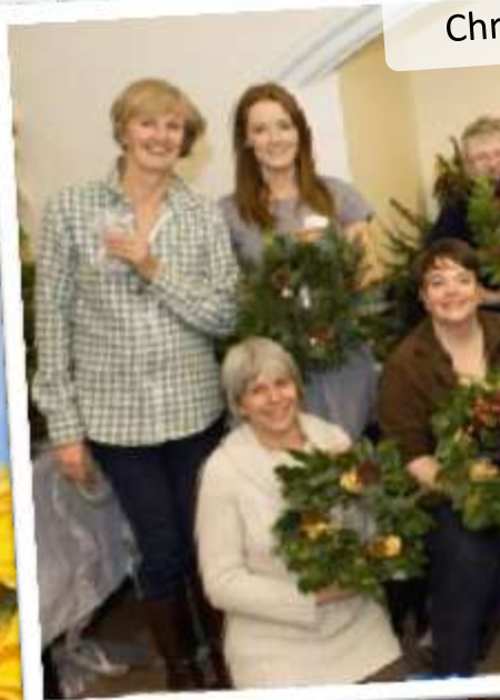
Christmas wreath making